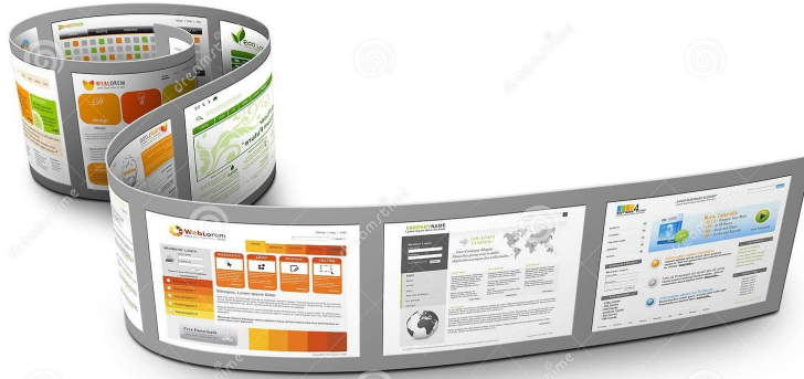
Film strip elements